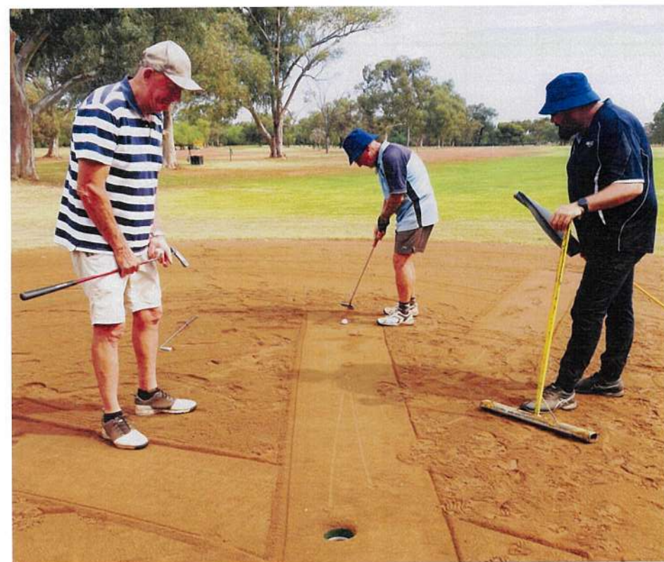
The Super Vet in action