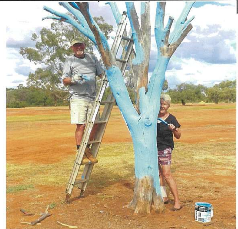
The Mick & Sally Tree